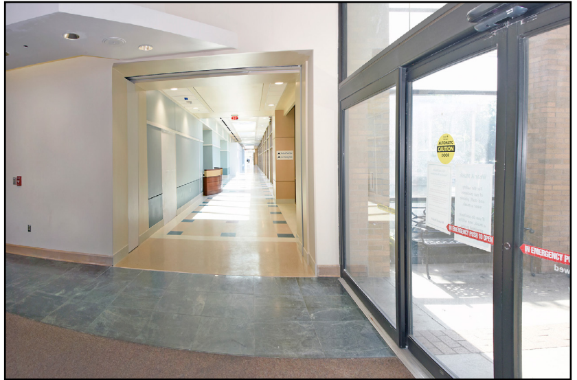
The McLeod Concourse South provides access for patients and employees to McLeod Medical Park East from the McLeod Pavilion.

In addition, a fence has been installed in front of the new Emergency Department building currently under construction. This is in preparation for the construction of the new ED entrance. The new fence will block access to the East Parking Deck from the Griffin Street entrance. All entrance/exit to the East Parking Deck must be made from William H. Johnson Street.