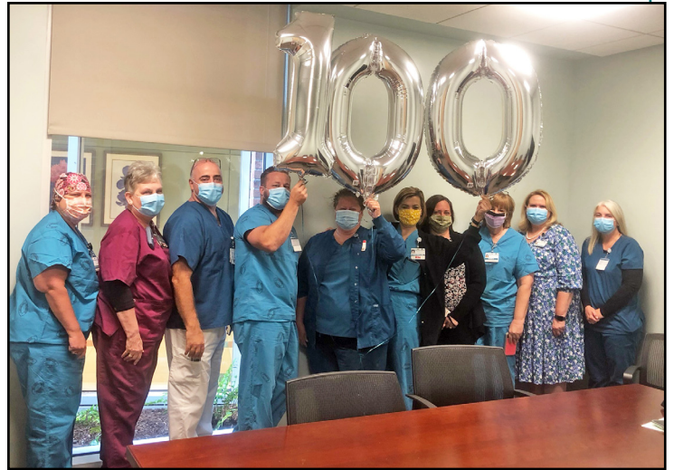
McLeod Health Seacoast teams celebrate the recent milestone of admitting 100 patients.

McLeod Health Seacoast recently celebrated a milestone by admitting 100 patients. The new patient tower at the hospital increased the bed capacity from 50 to 105 beds which was greatly needed as the previous facility had been running at or near capacity. Congratulations to all of the staff for transforming the delivery of health care in northern Horry County.