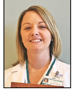
Amy Dove Pharmacy October 2019