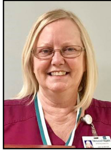
Charity Speigh Medical Surgical Unit November 2019