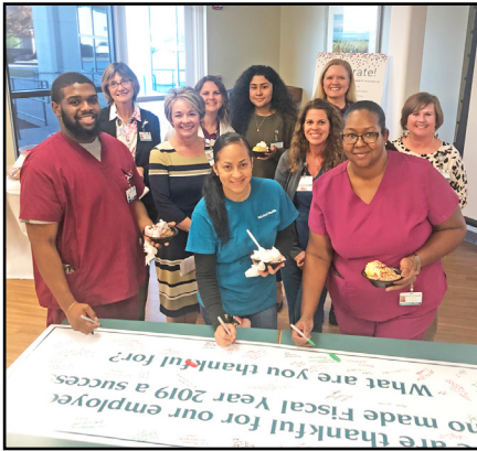
The McLeod Health Clarendon leadership team serves staff and volunteers ice cream during the hospital's recent celebration.

Over the past year, McLeod Health Clarendon has made great strides in its continued commitment to the patients and residents of Clarendon County and surrounding communities. Staff recently celebrated their Fiscal Year 2019 success on the following accomplishments: