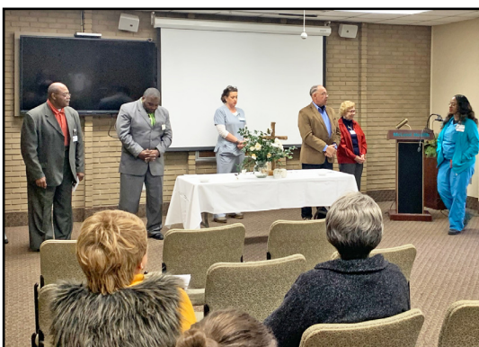
McLeod Health Dillon staff members and volunteer chaplains hold a Blessing of the Hands ceremony.

McLeod Health Dillon recently held a Blessing of the Hands ceremony for staff members. In healthcare, human touch is such an important component, especially meaningful to physicians, nurses and other hospital staff. Those who participate reflect upon the interconnectedness of their own humanity and the privilege to provide holistic care to their patients.