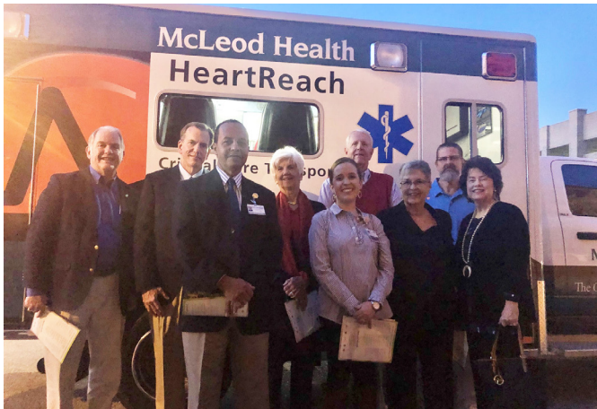
McLeod Health Clarendon Board Members and Providers recently visited McLeod Regional Medical Center.

McLeod Health Clarendon Providers, Hospital Advisory Board Members and Foundation Advisory Board Members were invited to join McLeod leadership and physicians for a behind-the-scenes tour of programs and services offered at McLeod Regional Medical Center on October 17.