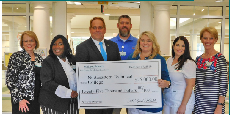
McLeod Health presents a donation to the Northeastern Technical College Nursing Program on October 17.