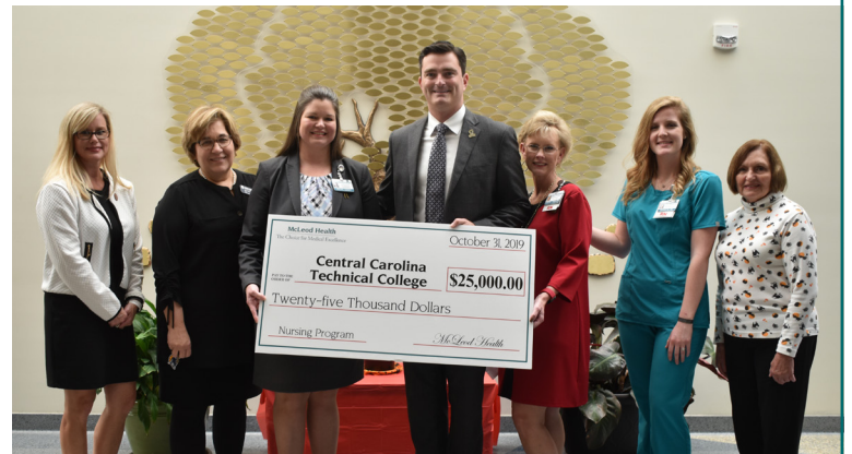
McLeod Health presents a donation to the Central Carolina Technical College Nursing Program on October 31.