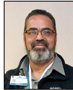
Terry Strickland Engineering October 2019