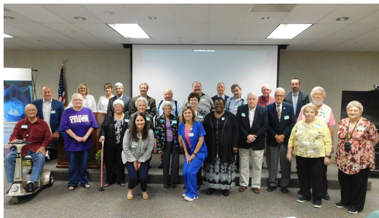
TAVR patients celebrate their improved quality of life with the McLeod Valve Clinic Team.