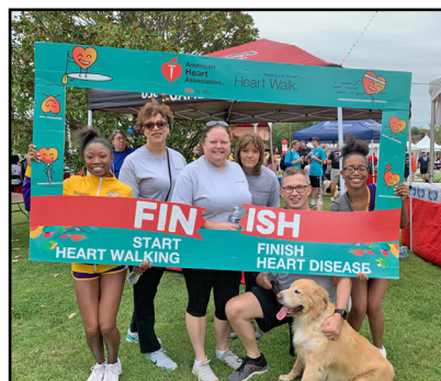
Staff representing McLeod Health Darlington participated in the Pee Dee Heart Walk on October 5.