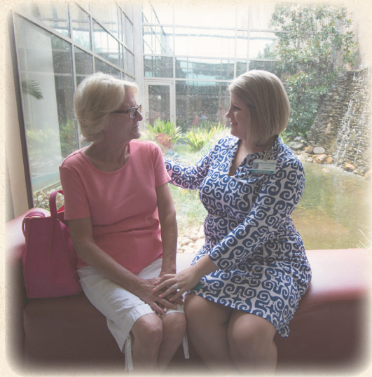
McLeod HOPE Fund Helping Oncology Patients Everyday