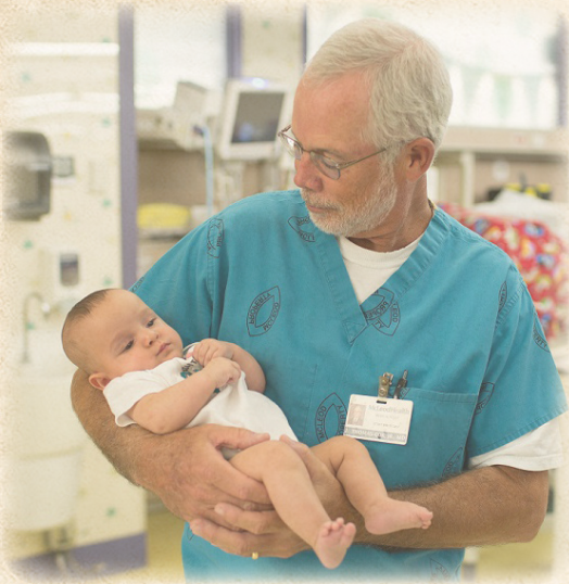
McLeod Children's Hospital