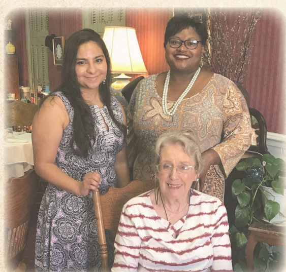
McLeod Endowed Scholarships