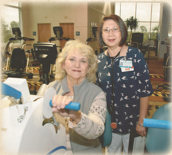
McLeod Cardiac Rehabilitation