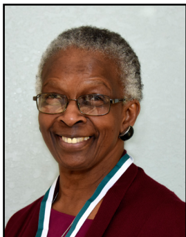
Rosa White Environmental Services December 2018