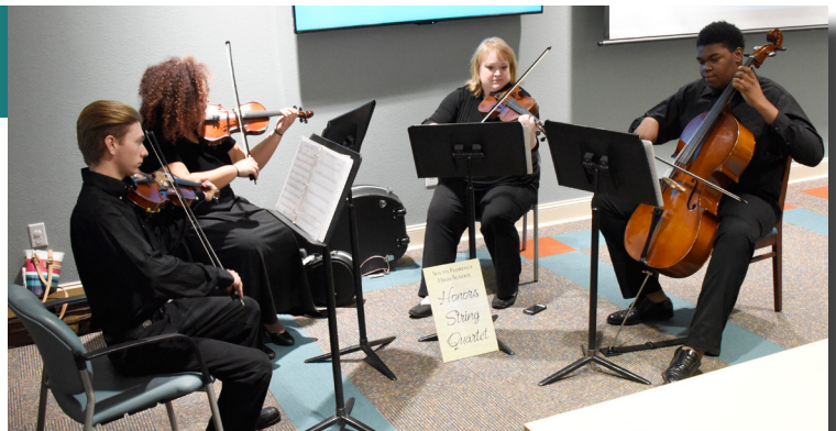
The South Florence High School Honors String Quartet demonstrate the importance of teamwork at a recent meeting for nursing leaders.

Sheet music symbolizes the roadmap of learning and