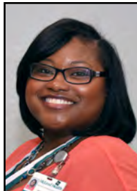
April Orange AHEC June 2018