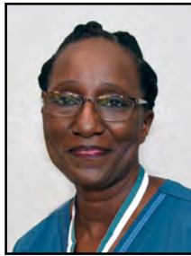
Martha Jefferson NICU May 2018