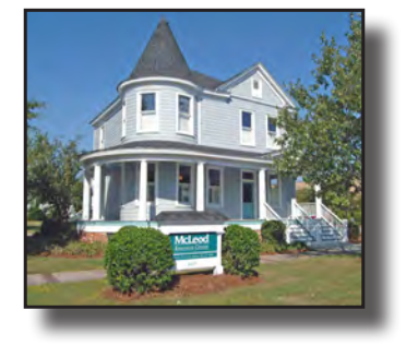
February Special: PersonalFit Connectors