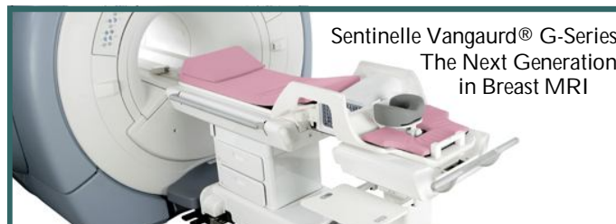
Sentinelle Vangaurd® G-Series The Next Generation in Breast MRI

This new piece of technology is called a Dedicated Breast MRI Biopsy Table and it costs $194,400. Breast MRI has the highest sensitivity for early detection of breast cancer in high risk patient groups. This biopsy table will allow for a customized exam that performs more accurate biopsies by permitting access to every quadrant of the breast. This addition to the McLeod Breast Health Program will improve diagnosis, provide access to better treatment options locally and possibly increase survival for cancer patients by detecting cancer at an earlier, more treatable stage. McLeod Health will be the fourth hospital in the state to offer this cutting edge technology ensuring that McLeod remains on the forefront in cancer care. The Breast MRI Biopsy Table will be in use by October of 2009.