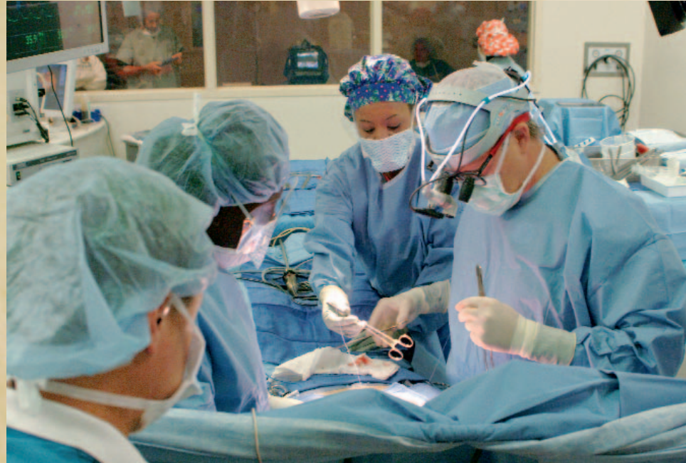
As part of the collaboration between McLeod Health and Cleveland Clinic, surgeries including this aortic valve replacement will be featured in upcoming webcasts available for viewing by patients and physicians around the world.

Four registered echosonographers with a combined 80-plus years of experience staff the Echocardiography Department. The McLeod Cardiac Catheterization Laboratory includes four cardiac cath lab rooms and one dedicated lab for electrophysiology